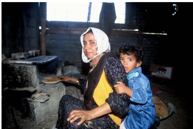
Empowerment of women in remote communities in Gaza through small grants programme

In December 1978, the UN General Assembly adopted resolution 33/147, which called on UNDP to provide assistance to the Palestinian people. By this date, the West Bank and the Gaza Strip had endured over 10 years of occupation, which had led to increased levels of poverty and unemployment. Hundreds of thousands were living in refugee camps in difficult conditions without the most basic amenities. Despite the steady population growth, infrastructure had been allowed to deteriorate, including schools, health facilities, housing, roads, and water and sanitation systems.