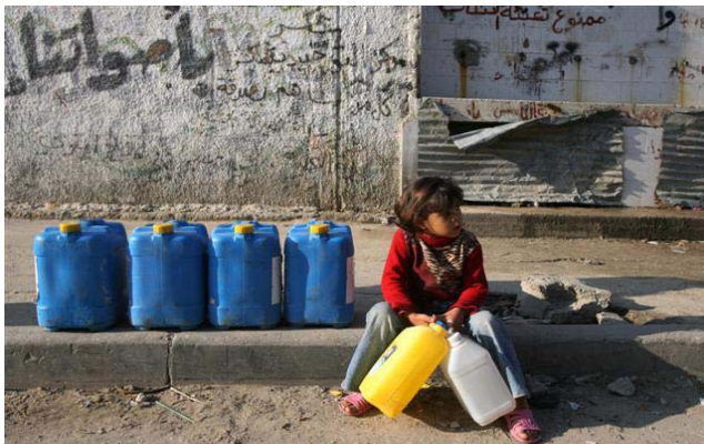
A child waiting to collect water in Rafah near the Gaza Strip's border with Egypt

The Gaza Strip is one of the most densely populated places on earth, with a total area of 365 km 2 and a population of over 1.4 million . Against the backdrop of occupation, the elections in 2006, the Hamas takeover of the Gaza Strip, and the resulting escalation in tensions, the situation for Palestinians in the Gaza Strip has worsened, with marked increases in unemployment, poverty and deaths. This situation has been compounded by the recent military incursion. Not only have people's livelihoods been severely affected, but entire families are rendered homeless. In addition, the crippling effects of the closures have been widely felt, with hundreds of thousands of jobs being lost, people prevented from reaching their places of work, children unable to attend their schools, fuel and import shortages kept at a bare minimum, and the majority of the population dependant on humanitarian assistance.